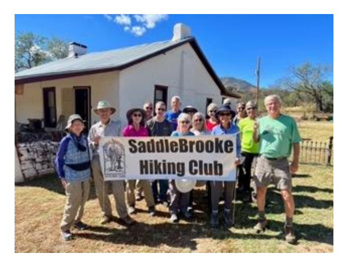
Members of the SaddleBrooke Hiking Club at American Flag Ranch House

At the end of the event, SaddleBrooke hikers toured the historic American Flag Ranch House.