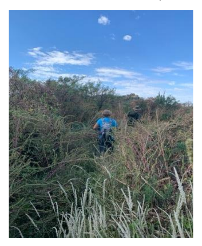
Beth Jones and Frank Earnest pushing through the overgrowth along the Hidden Canyon trail, Golder Ranch area.

undergrowth, and then the 2020 Bighorn Fire which started on June 5 and burned for many weeks. The Bighorn Fire, which was finally contained on July 23, consumed 120,000 acres in the Catalina Range