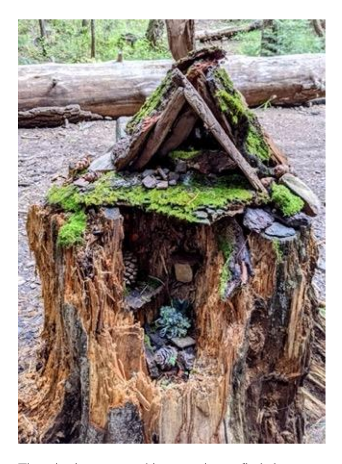
There is always something amazing to find along our trails!