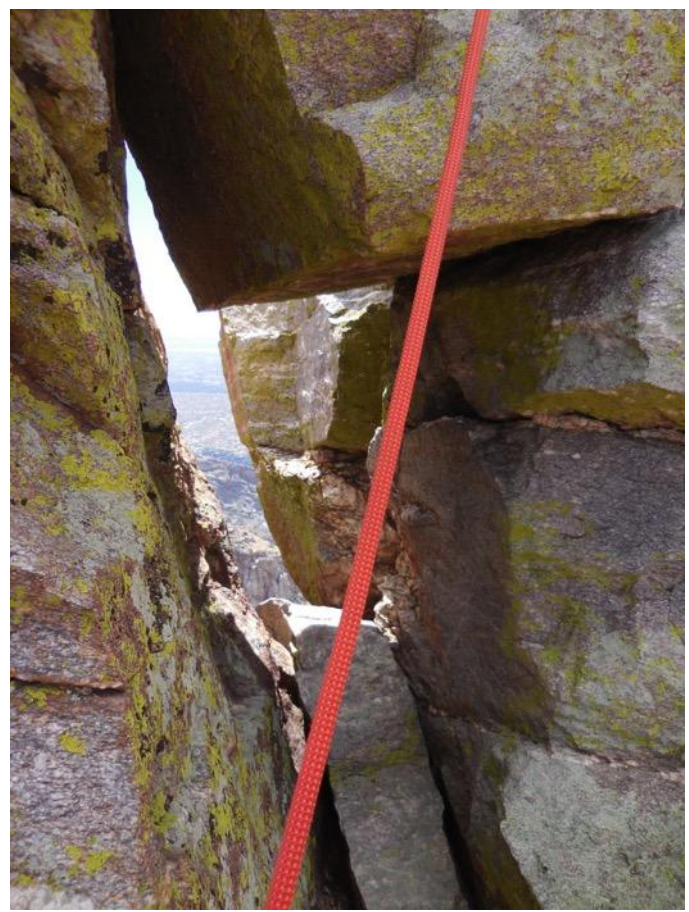
Opening at the top beneath the chock stone

These features provide the successful climber with a somewhat exciting summit. The hike round trip is about 7.5 miles and 3,900 feet total ascent.