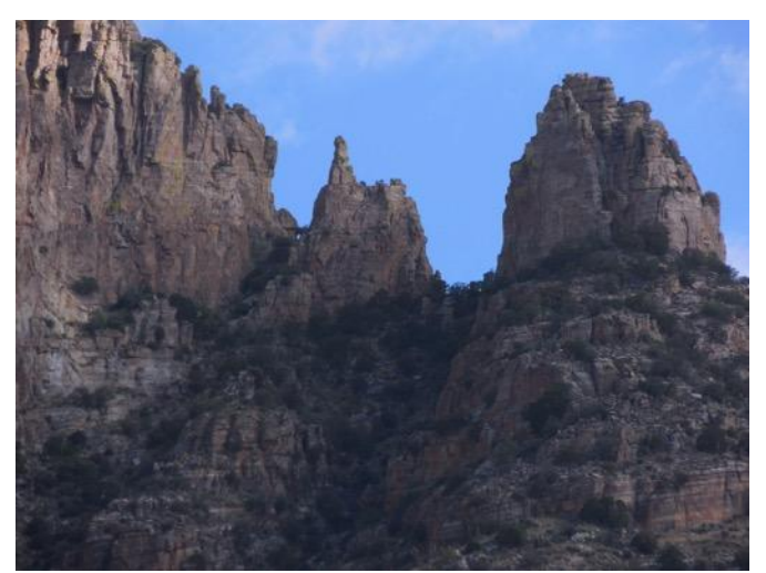
From left: Prominent Point, Finger Rock, and Finger Rock Guard

Finger Rock is a famous Tucson area landmark that rises several thousand feet above the valley floor along Pusch Ridge of the Santa Catalina Mountains. The striking rock formation resembles a finger set atop a closed fist that is flanked by two shear rock walls - on the east by the Finger Rock Guard and on the west by Prominent Point. The exposure at the top is considerable, but views north and south are magnificent.