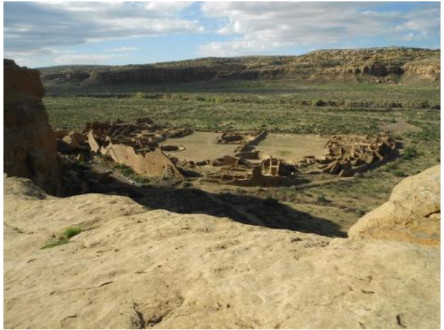
Chaco Pueblo Bonito

On Sunday, after another satisfying group breakfast, volunteers were again ready with daypacks before 8:00 a.m. Sunday's goal was to reach the great house of Penasco Blanco (via the Penasco Blanco Trail). Penasco Blanco is the Canyon's longest trail and includes the Petroglyph Trail, which has views of numerous Pueblo and Navajo petroglyphs and historic inscriptions. The trail continues to the "Supernova" pictograph site and Penasco Blanco, an unexcavated great house with a unique oval design and a spectacular natural setting. Work included reinstalling ropes, which protect sensitive site areas. Adequate time was available late Sunday to visit the Visitor Center and view the Park Service film describing the Park and its meaning to Pueblo Indians.