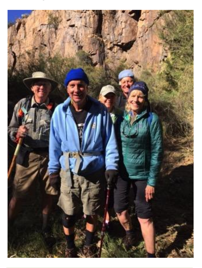
MARBLE CANYON Submitted By Susan Hollis

were at their peak. Aravaipa is often promoted as a possible national monument. If you are fortunate, the walk in Aravaipa Creek provides an opportunity to see coatimundis and big horn sheep. The day of hiking ended up being very pleasant as the temperature soared into the high 60's.